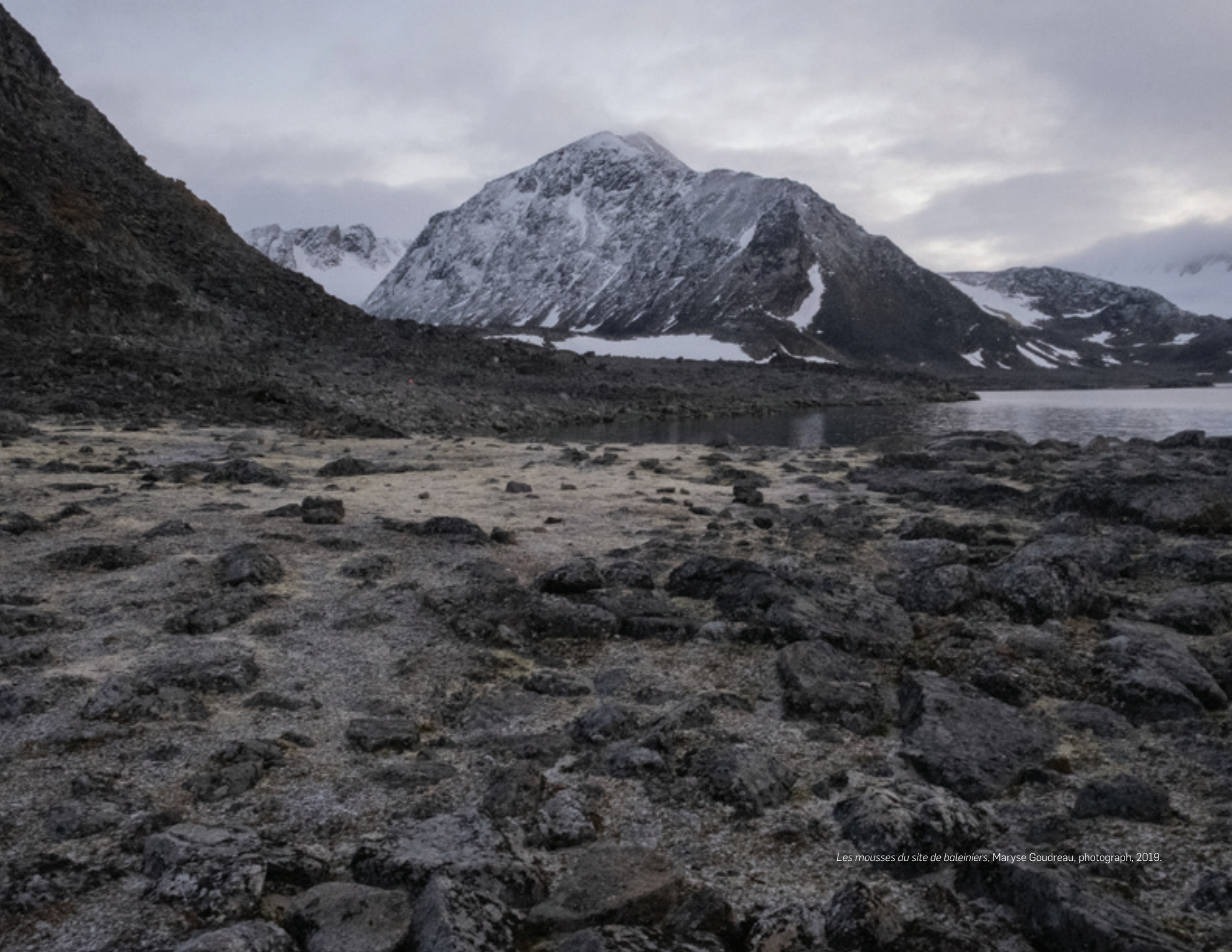
Les mousses du site de baleiniers, Maryse Goudreau, photograph, 2019.