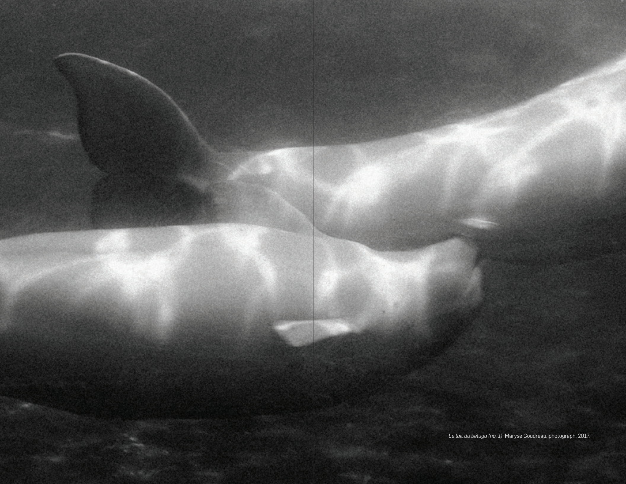
Le lait du béluga (no. 1) , Maryse Goudreau, photograph, 2017.