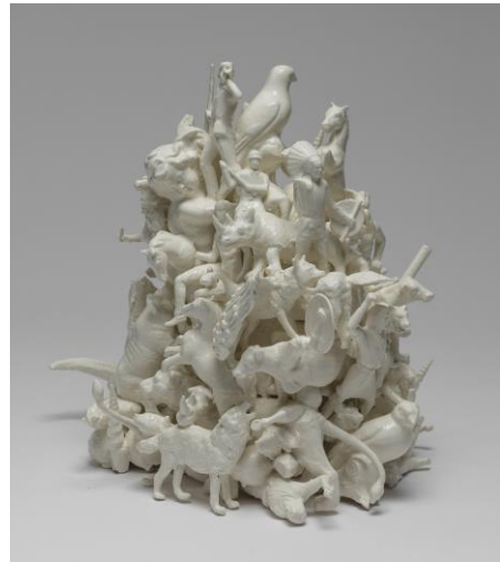
Pierre Durette, Contingent 2.7 , 2013, porcelain.

Two years, two curators, and 10 artists (multiplied by countless influences) lie behind the reflective meanderings of the exhibition Vivre ensemble—The Connections . Ranging from abstract musings and theoretical concepts to the concrete realities of day-to-day life, this exhibition considers otherness in direct relation to the self, wherein the notion of the individual as an isolated and pure entity is rendered ultimately irrelevant. This project explores contexts where the boundary between the self and others is erased, and the individual is necessarily and integrally linked to the outer world. Featuring drawings, photographs, sculptures, and videos by a varied group of artists, Vivre ensemble—The Connections brings together a range of sensibilities, cultural frameworks, and questions with links to natural science, sociology, and philosophy.